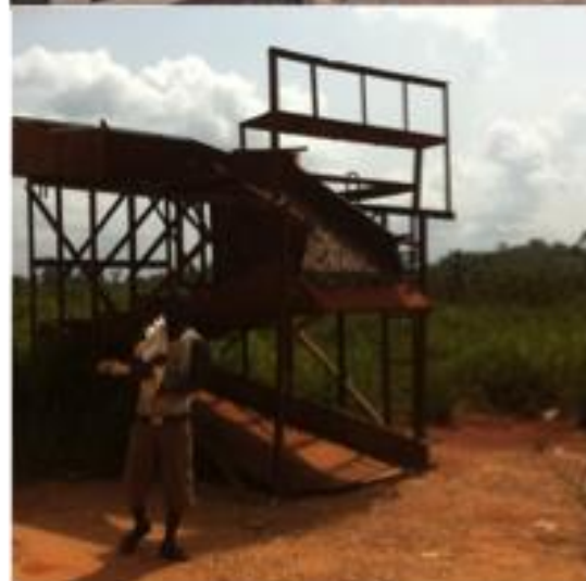
Photos taken during the data collection phase. From the top: Used lead-acid battery recycling site; Electronic waste recycling site; Small-scale gold mining site.