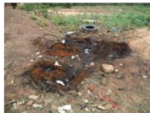
Photos taken during the data collection phase. Local residents and livestock adjacent to a contaminated site; Children playing on an informal garbage dump; The remnants of tires at a burn site.